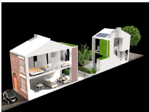
How the terraces could be adapted and extended