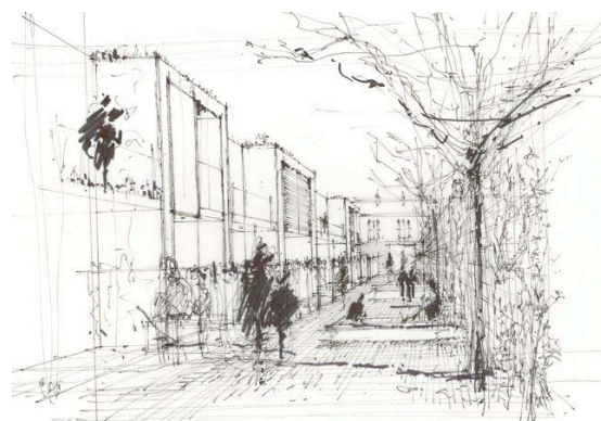
A possible rear yard perspective