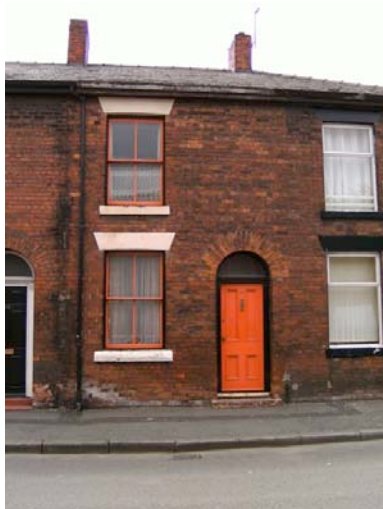
An Existing Toxteth Street terraced house

E: markhines@markhines.co.uk T: 020 3217 2050 M: 07816 492337 www.markhines.co.uk